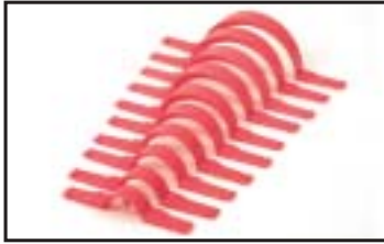
HDPP straps in 1/4" increments

Accommodates: Single Bar #6 - #20; Multi-Bar/Strand Anchors; Encapsulated (DCP) Anchors; Steel or Plastic Pipe Applications. Ideal for Soil Nails, Rock/Soil Anchors, Micro-Piles, Auger-Cast Piles.