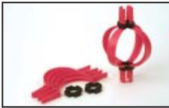
HDPP before & after assembly, 8" o.d.