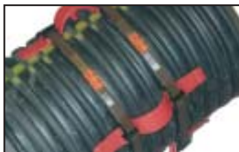
Qtr. collars w/ strap retainers, 10" duct