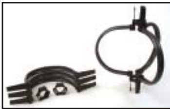
PVC before & after assembly, 14" o.d.