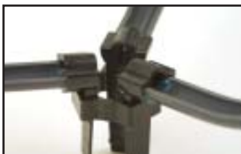
PVC collar housing assembly